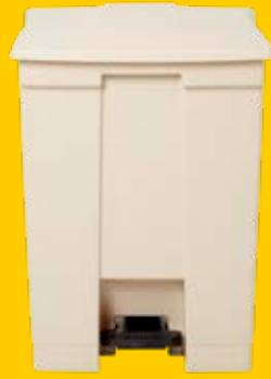
FG614500BEIG 18 GAL